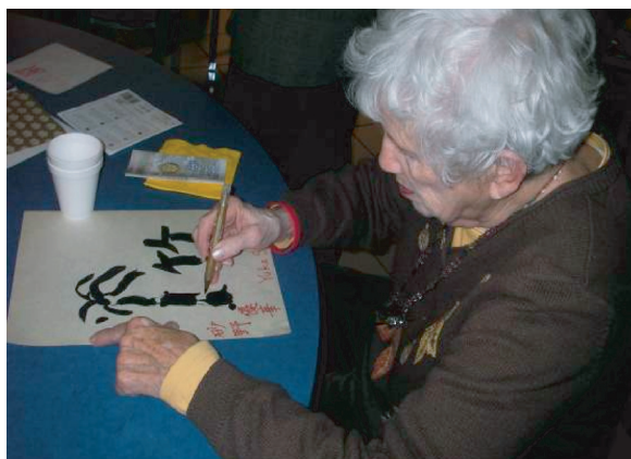
(calligraphy) wrote one character each