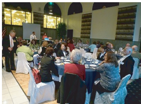
Multi Club Meeting