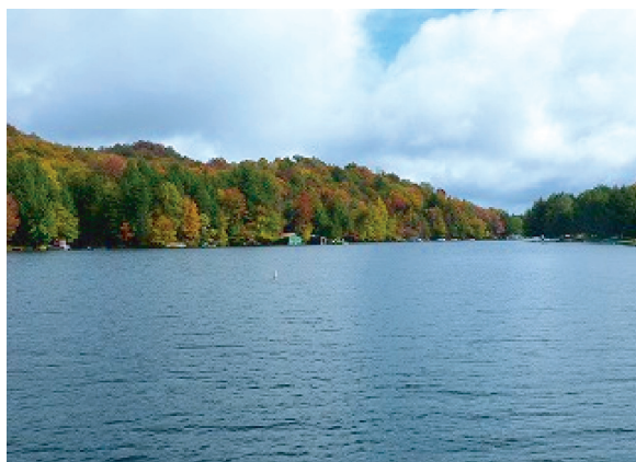
Old Forge にてボートクルーズ（初雪を体験）