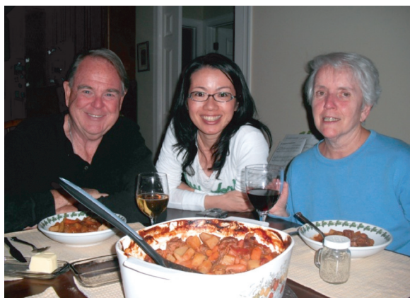
Host Family (Baldwinsville)