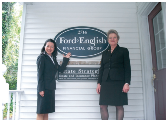
職業訓練 投資会社を訪問 (Utica)