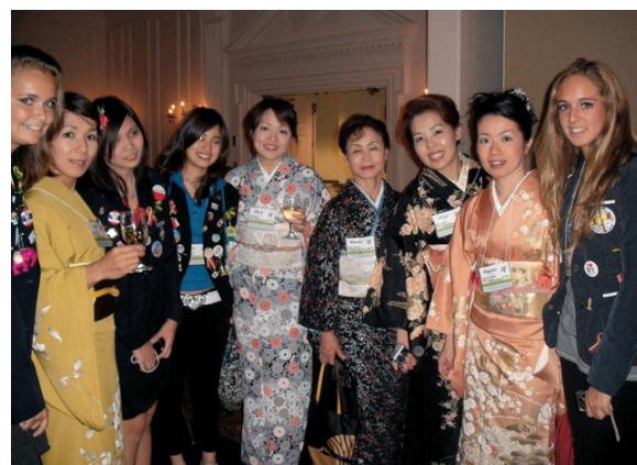
District Conference (With exchange students)