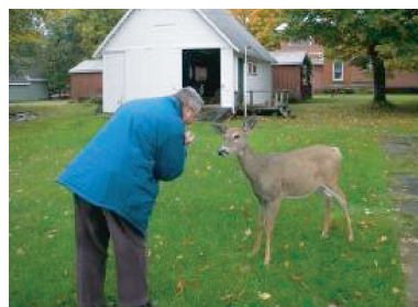
Feed the deer