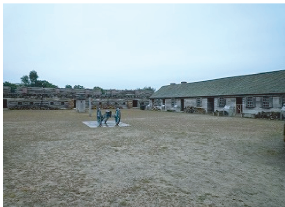
Fort Stanwix National Monument