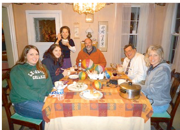
Japanese Food Party