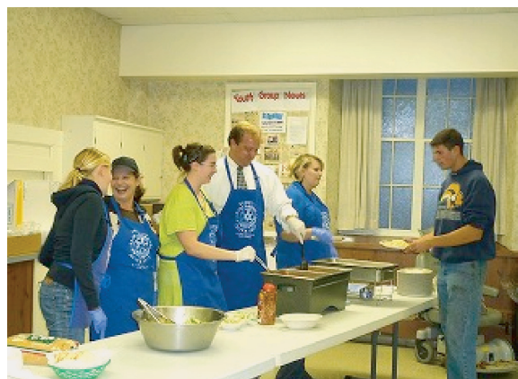
Food Service Volunteer