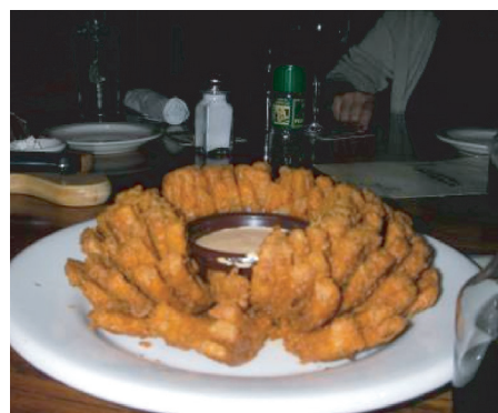
Onion flower !?