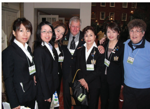
District Conference (With Governor)