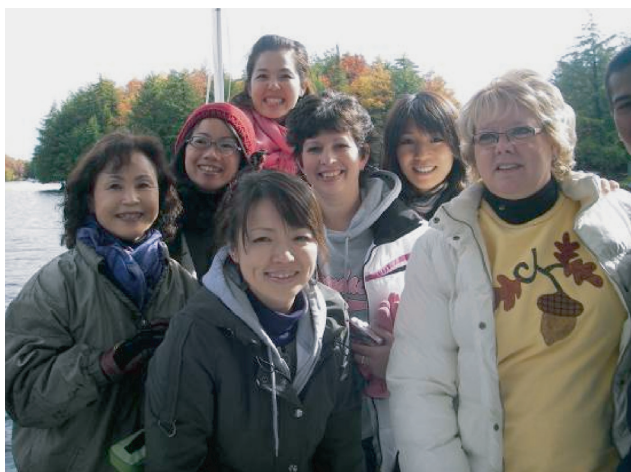
On the boat