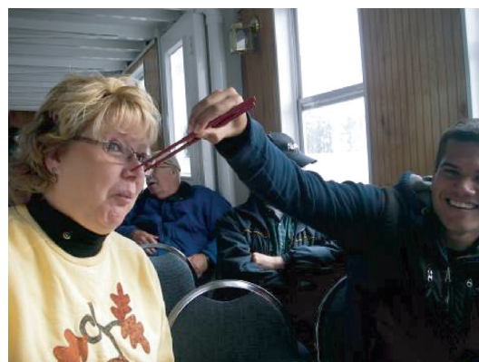
With chopstick s !