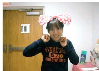
At the church