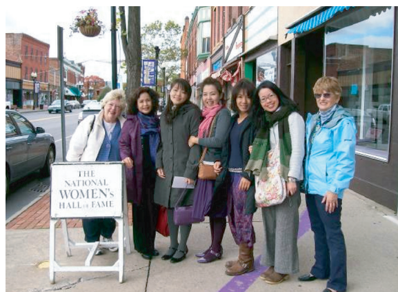
Women's right museum